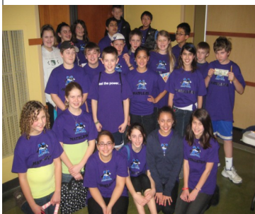
Pictured -- 6 th Grade Math Club at the Mount Rainier Invite (January 2010)