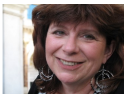
Mrs. Bento Kindergarten